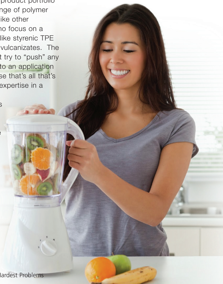
The Monprene RG series of styrenic-based TPEs, developed specifically for of food contact applications with grades complying with US regulations and European directives for food contact.

#2 Customer intimacy is also key to determining a solid supplier. A supplier needs to ask the right questions and really listen to the customer while translating the end-product’s requirements into the right TPE material properties. The TPE supplier needs to know what type of environment the material will be exposed to, understand what the regulatory requirements are for that market, and what performance characteristics are of importance. Every customer interaction is different, depending on whether working with an OEM, a designer or processor and in what stage the client is in with regards to the design cycle. According to Teknor Apex experts, “Our main goal is to determine if there is a fit between our products and what the customer needs,