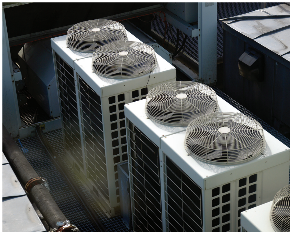
Sarlink TPE-Vs outperform PVC in industrial sealing applications, including uses in HVACs.

Food grade silicone products are used in a wide range of applications, from spatula blades to seals in commercial ovens. Silicones exhibit superior resistance to heat and chemicals, which is particularly important for oven seals and bakeware. However, for typical food